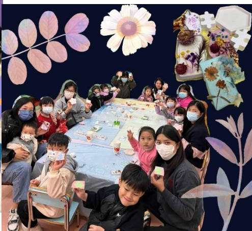
Parent-Child Fun with DIY Clay Tray