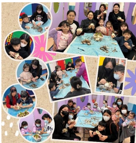
Lunar New Year Flower Activity