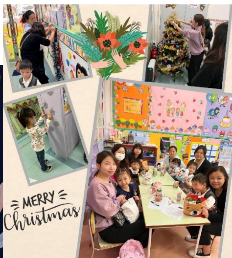
Parent-Child Christmas Decorations